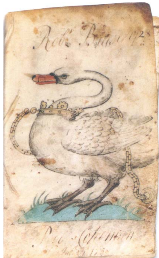
Above The swan as a royal bird, 1693, from a register kept by the deputy swan master of the Rivers Yare and Wensum. Accn Han 13/07/1972

Use of NRO sources at the Norfolk Heritage Centre is not recorded separately, but anecdotal evidence indicates that the most popular NRO films and fiches available there are parish registers, tithe maps and electoral registers. A duplication programme for the Norfolk Heritage Centre resumed, in order to update the NRO stock which it holds and in preparation for the temporary closure of the Record Office.