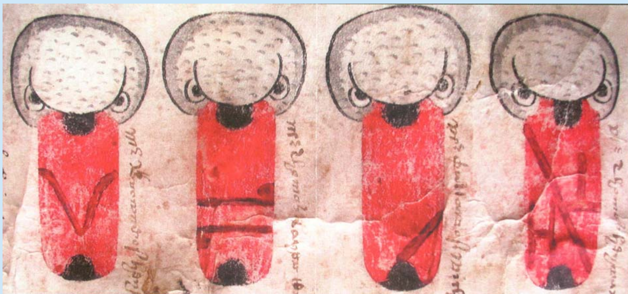
Above The 'Haveringland' swan roll for the Broadland area, c. 1650. NRS 27123, 361X1

produced in collaboration with the NRO Archive Specialists there. At the Royal Norfolk Show in June, the NRO's Education and Outreach service was featured in a display aimed at schools and teachers. It was also mounted, by invitation, at the Annual Headteachers' Conference at the University of East Anglia in September.